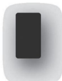
Printed on flexo.

this is what will be the final product when using drop shadows.